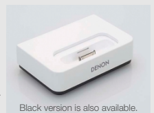
Black version is also available.

*Subscription to XM services also required.