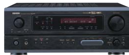
Front panel with terminal cover.