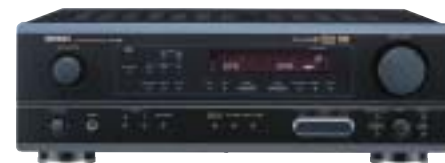
Front panel with terminal cover.

*Design and specifications are subject to change without notice.